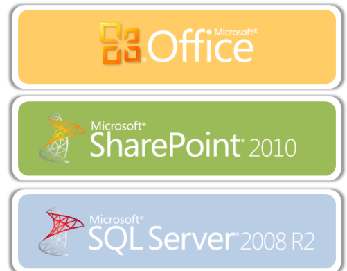
Figure 1: Microsoft Business Intelligence

IT benefits from the managed self-service capabilities within PowerPivot, by efficiently creating reports using SQL Server Reporting Services 2008 R2 and providing presentation quality reports via SharePoint, while end users work directly with current and relevant data.